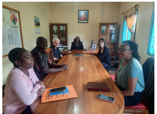
Meeting between TFS and SIDO Iringa staff.

and 11 tool starter kits (carpentry, building, auto mechanic).